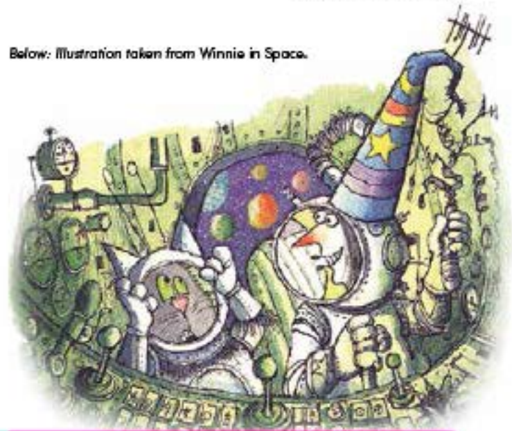
Below: Illustration taken from Winnie in Space .